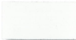
High Gloss White*