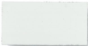
Low Gloss White*